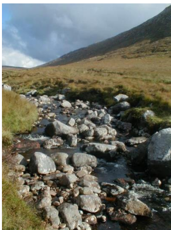
Fig. 2: Typical upland headwater stream

Most small streams in Ireland are perennial, flowing in all seasons in response to rainfall that is also generally well distributed through the year. Although less common, some streams are temporary, flowing for only a part of the time. Temporary streams include both intermittent streams which only flow during certain parts of a year and ephemeral streams which typically only flow during flood events. Headwater flows arise from several different sources: seepage from soils (including peatlands), subsoils and aquifers, springs and lake outlets. Differences in geomorphic, hydrological, precipitation and ecological conditions lead to their broad instream habitat heterogeneity.