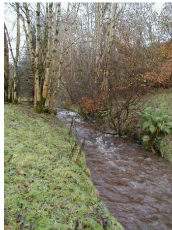
Fig. 3: Small lowland stream