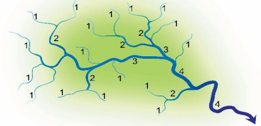
Fig. 1: Strahler stream order

Small streams have been defined in many different ways but they are generally considered to lie within the headwaters of rivers extending only a few kilometres from their source. Most are therefore first or second-order (Strahler) streams (see Fig. 1) with small catchment areas and narrow channel widths (generally <3m).