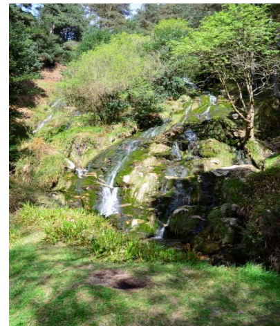
Fig. 4: Temporary stream in summer